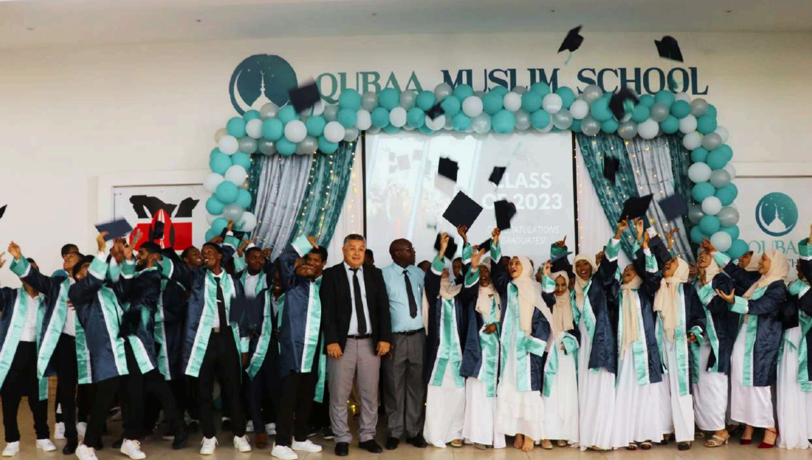
Celebrating the class of 2023- A journey of growth, achievement and new beginnings.