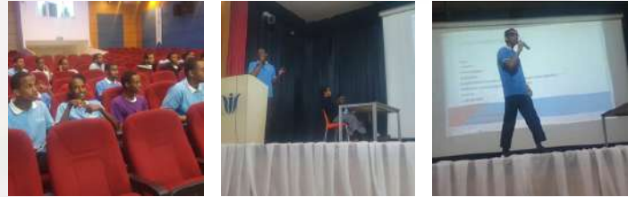
The mathletees of the Pie Day were the Grade 8 Boys and Form 1 Boys.